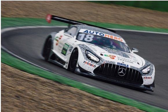
The Mercedes-AMG GT3 presents itself with a fresh design update. Development carrier for the Space Drive electronic steering system and a key technology for autonomous driving.